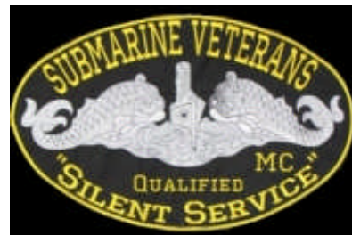
Silent Service Motorcycle Club Internet Base (SSMC)