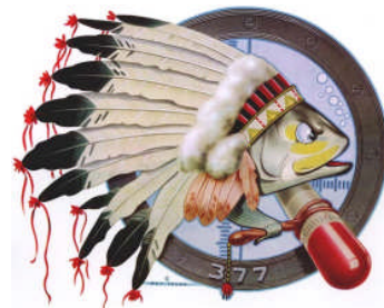
USS Menhaden (SS 377)