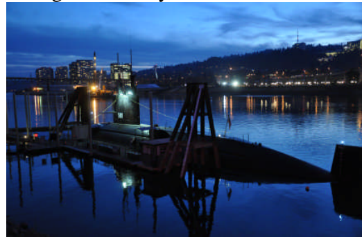
Blueback Museum Boat

I arrived in Portland a couple of hours early, and paid a visit to Blueback at the Oregon Museum of Science & Industry (OMSI). She's in great shape and I got some awesome photos. Tours are given throughout the day.