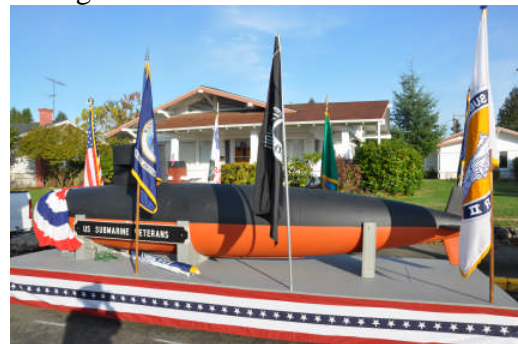
Seattle Base Float

Base members appeared with their float in several parades and community events throughout summer and fall.